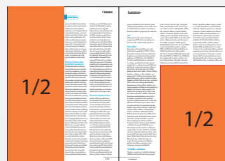
105 x 297* 658 EUR