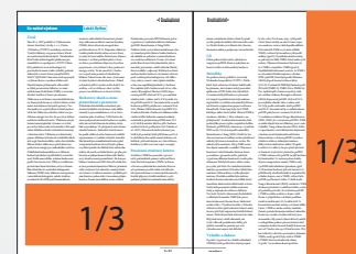
182 x 80 453 EUR