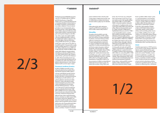
133 x 297* 864 EUR