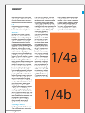
73,5 x 297* 453 EUR a) 85 x 120 b) 120 x 85 370 EUR

* To the stated sizes (mm) it is necessary to add 5 mm on each side. Rules for publishing advertisements and business articles - see general conditions. Prices do not include VAT.