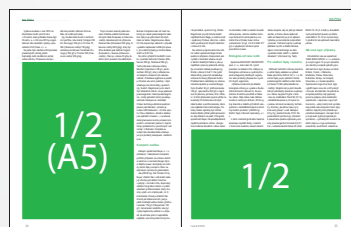
149 x 210 1 152 EUR