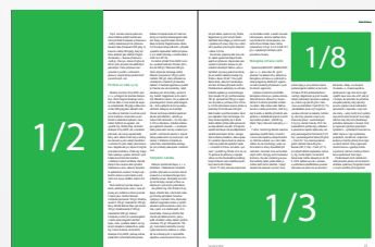
112 x 297* 947 EUR