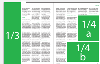
72 x 297* 864 EUR