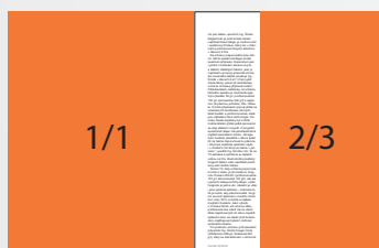
230 x 297* 149 x 297* 1 520 EUR 1 360 EUR