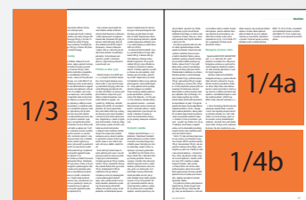
72 x 297* 1/4a 840 EUR a) 97,5 x 120 520 EUR