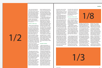
112 x 297* 1/8: 98 x 63 920 EUR 280 EUR