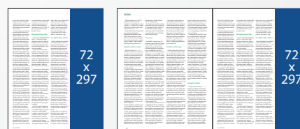
Series in editorial text