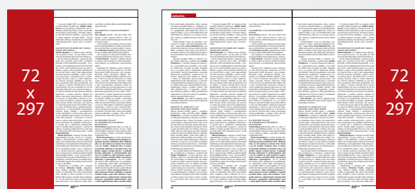
Seriesin editorial text