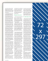
Series in editorial text