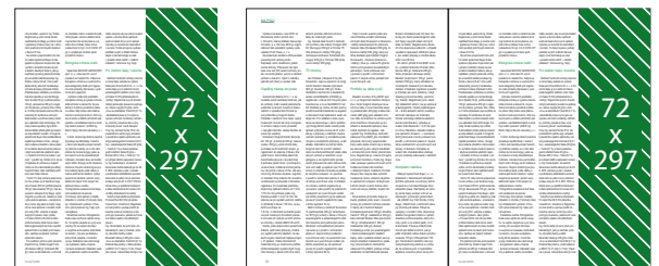
Series in editorial text