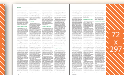
Series in editorial text