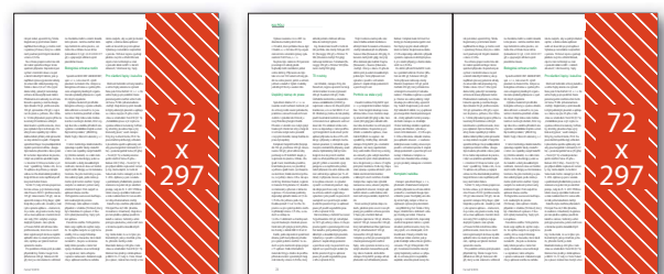
Series in editorial text