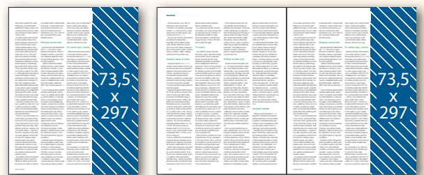
Series in editorial text