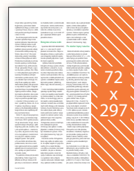
Series in editorial text