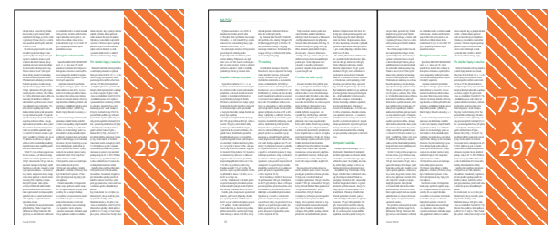
Series in editorial text