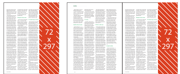
Series in editorial text